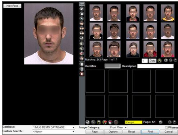
Fig1: Face IT software compares the face print with other images in the database.

evaluate the different features of the faces. Face recognition has been taken in various securities related applications such as surveillance, e-passport and access control.