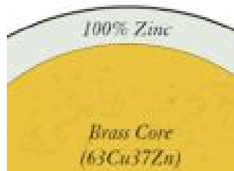
Fig.3 Cross-section of coated wire electrode

lead, antimony, bismuth and alloys thereof, protecting the core of the wire against thermal shock resulting from the occurrence of electrical discharges and which permits to increase the frequency of the electrical discharges without running the risk of rupturing the wire. US Patent No. 4,968,867-90 discloses a wire electrode for wire cut electrical discharge machining, which includes a core wire having relatively high thermal conductivity, a lower coating layer formed by a low-boiling point material (for example, zinc) and an outermost layer of brass having high mechanical strength. An EDM wire with a copper bearing core and a substantially continuous coating of porous epsilon phase brass, wherein said porous coating has been infiltrated with graphite particles [US Patent No. 20070295695].