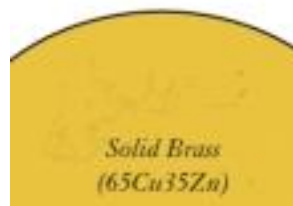
Fig. 2 Cross-section of plain brass wire electrode

Various attempts have been made in the past to improve wire electrodes. Copper, which was in common use at first, has been replaced by brass. It has been discovered that the addition of zinc (zinc + copper = brass) improves the cutting performance and speed when compared to the copper in several ways. During the cutting process, the zinc in the brass wire actually boils off, or vaporizes, which helps cool the wire and delivers more usable energy to the work zone [6]. In some circumstances significant brass deposit can remain on the workpiece after the cut which is proved to be difficult to remove. Since, it is not practical to cold draw wire with higher zinc content in excess of 40%, which led to the development of coated wires [7]. Fig. 2 shows the cross-section of plain brass wire electrode having composition Cu 65% Zn 35%.