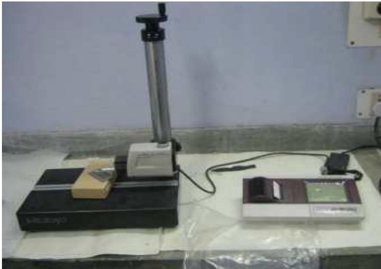
Fig- 2: Mitutoyo - SurfTest SJ-400 surface roughness tester

Measurements are carried out of 6 mm measurement length at the bottom of the blind holes using a Mitutoyo-SurfTest SJ-400 surface roughness tester.