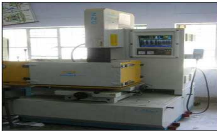
Fig- 1 Electronica-Smart ZNC-EDM machine tool

Electronica made "Smart ZNC die-sinking Electric Discharge machine tool" with MOSFET S50 ZNC pulse generator have 400 lt dielectric capacity with DC servo feed control system is used in the experimental setup. Figure 1 shows a photograph of this equipment.