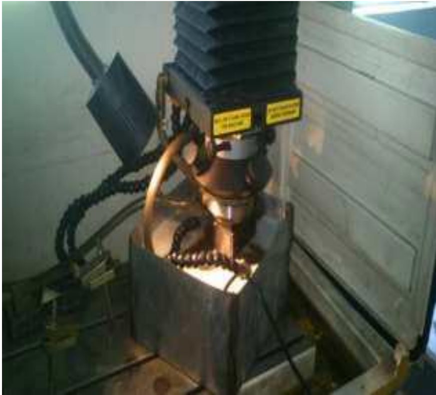
Fig- 3 Small working tank and jet flushing system used in the EDM process

Two nozzles of dielectric pump were placed in such away so that these do not come beneath the tool tip moved downward by the servo system of machine tool. The downward movement of tool electrode towards workpiece surface has been controlled by servo feed control system of EDM machine tool, which maintained uniform sparking gap between the adjacent surfaces of work piece and tool electrode. Guide wheels on the EDM machine tool tank helped to position the workpiece with respect to the axis of approaching tool electrode. All the experiments in which 4g/l and 8g/l powder concentration used are performed in this small tank. Experiments in which pure EDM oil (0 g/l concentration of silicon powder) used are performed in machine tool working tank.