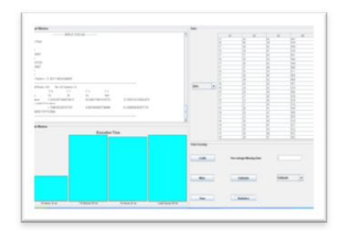
Figure 4: Running Snapshot of the Proposed Work