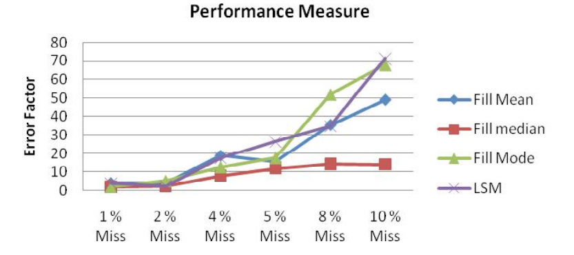
Figure 2: 2 D Representation of Error factor Measured for various data missing rate.