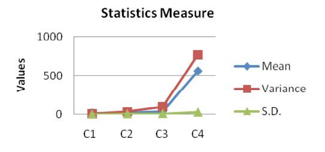
Figure 5: Statistical term for each column of data set